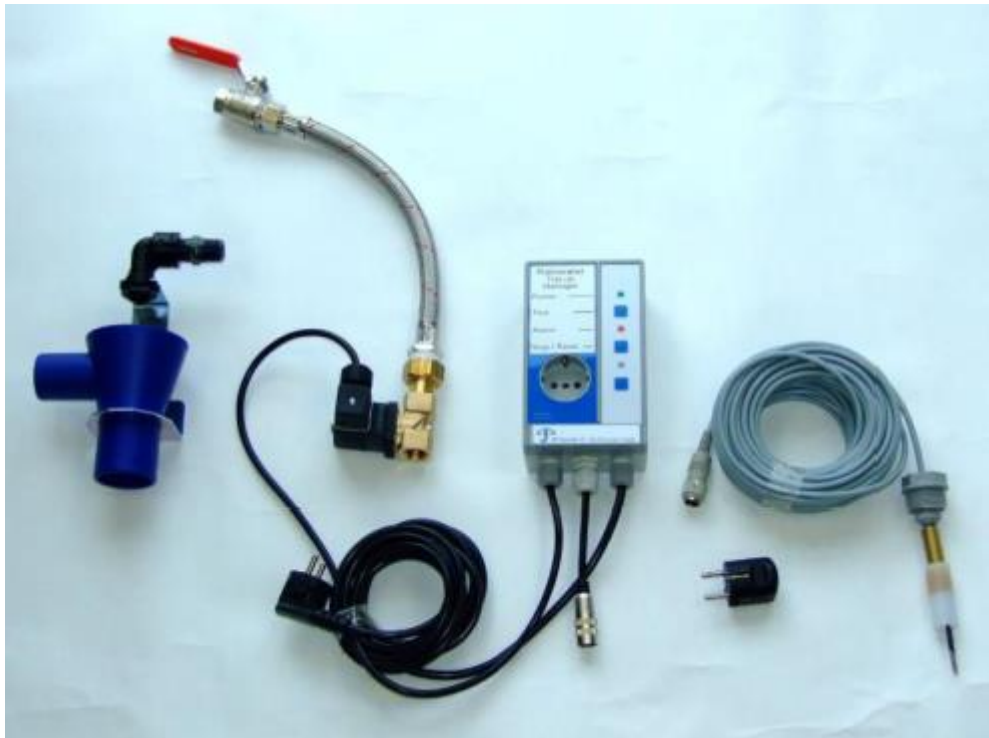
Figure 3 3P Mains Water Top-UP Set