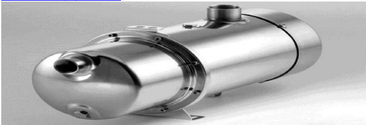
Figure 1 Submersible Pump